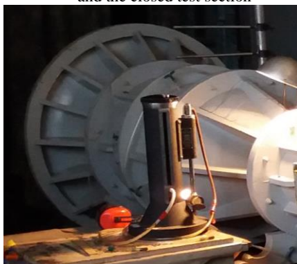
Fig. 3. The aspirator