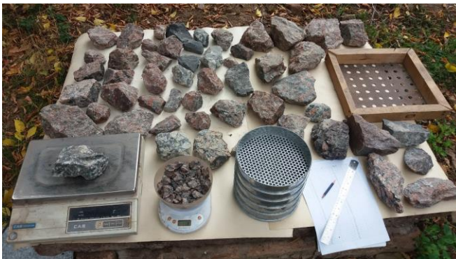
Fig. 1. The rock mass sample with size-sorted fractions

Results and discussions. Modeling the dust formation process requires information on the number of fine fractions in the rock mass which are intended for the process. For this purpose, the particle size distribution of the rock mass sample of about 70 kg was determined. The sample with size-sorted fractions is given in Fig. 1.