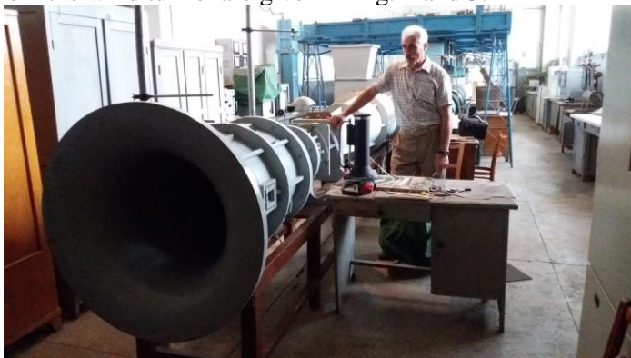
Fig. 2. The wind tunnel AT-2K-250/500 with the open flow and the closed test section

As mentioned above, the dust formation process was modeled in the wind tunnel AT-2K-250/500 with the open flow and the closed test section and an aspirator with a drive and hoses for air and its filtration. The laboratory bench and the aspirator for polluted air bleeding from the wind tunnel are given in Fig. 2 and 3.