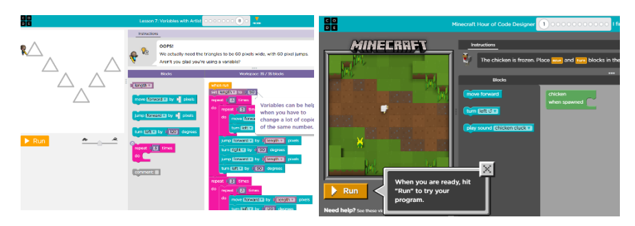
Fig. 1. The complex of educational games "Hour-of-code"

To investigate e-tools for young learners we chose the e-courses for 3-4 grades at elementary school: the complex of educational games "Hour-of-code" for teaching Computer Science with young learners (Fig. 1); the e-course GeoGebra for Mathematics lessons "Adding Fractions" (https://www.geogebra.org/m/xm7EHdmG), "Build a Square Workshop" (https://www.geogebra.org/m/w6kbvzmp) (author John Golden) (Fig. 2); the e-course that is a part of the English language course "Fairyland Express Publishing i-eBook" (Fig. 3), and other popular e-courses as e-tools.