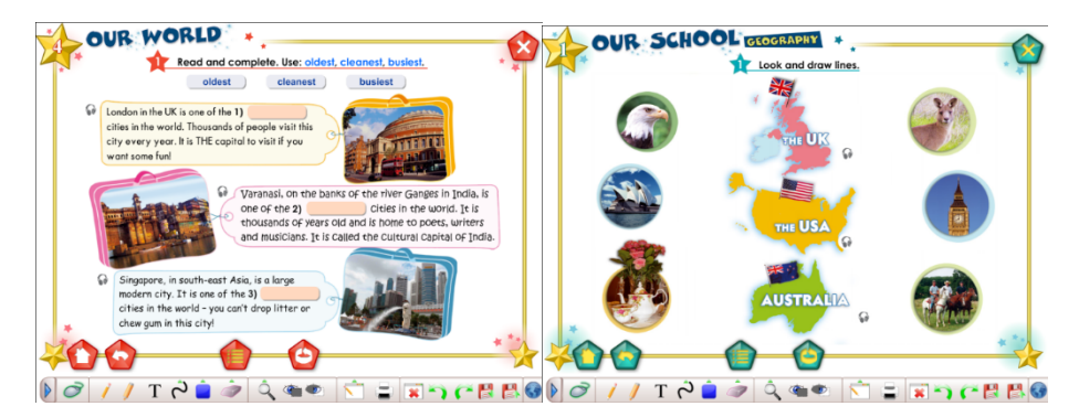
Fig. 3. The course "Fairyland Express Publishing i-eBook" for English

Theoretical ones: analysis of scientific works, systematization of scientists' views and results, study of documents (to know the requirements for e-tools, to determine some aspects of training teachers-to-be to evaluate e-tools for young learners).