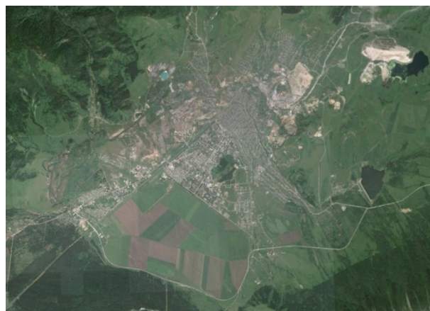
Fig. 1. Survey image of the research area (Google Earth).

and hiking); ecological and educational (amateur photo safari, spa treatment, fishing and hunting, village, ethnic and ethnographic). The territory of the mountain suburbs of Ridder is suitable for organizing almost all types of geotourism.