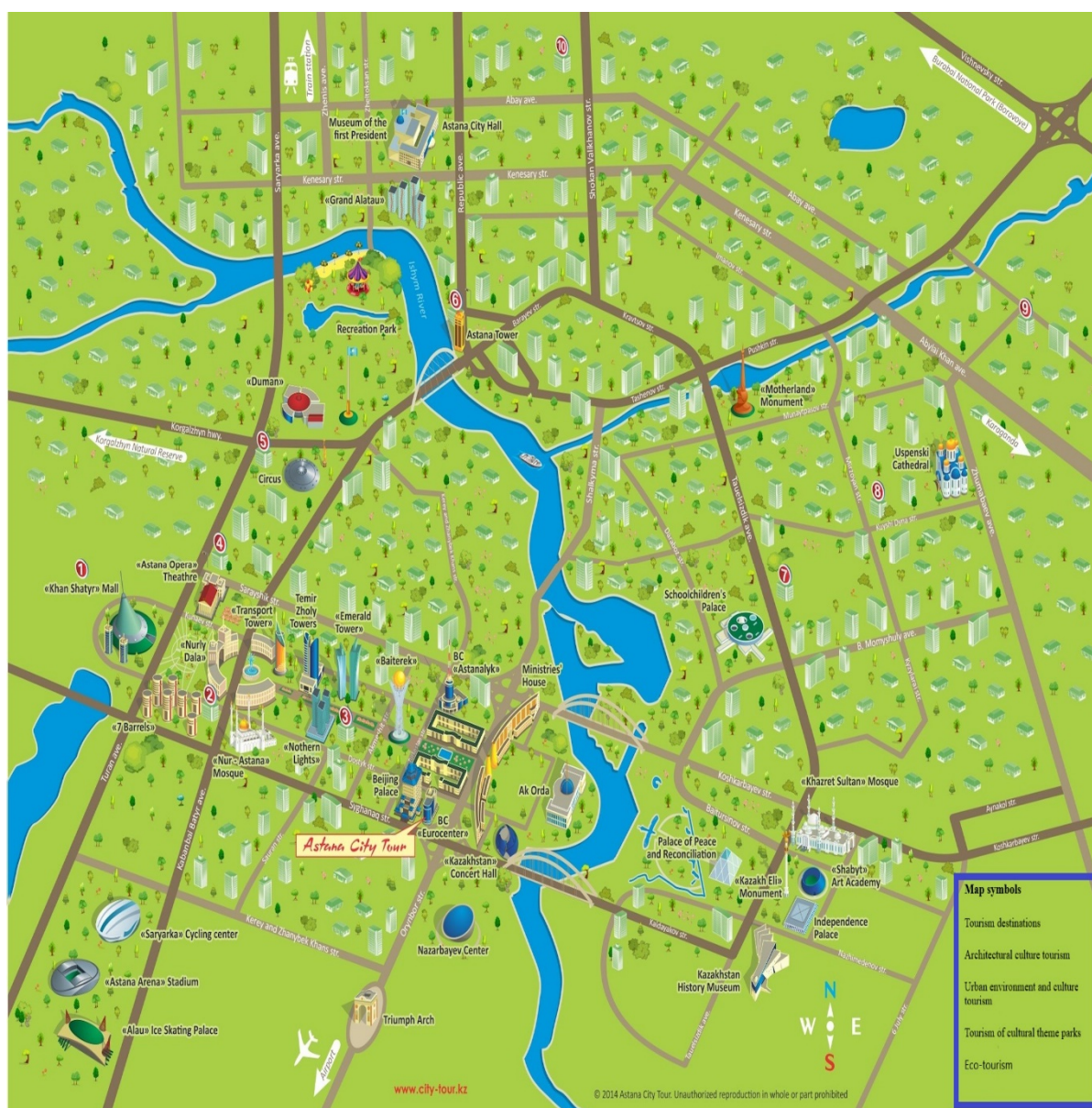
Fig. 4. Scheme of a complex tourist route on the territory of Nur-Sultan.

In the work carried out, the map of the city of Nur-Sultan was used, covering the objects of tourist infrastructure (Figure 4).