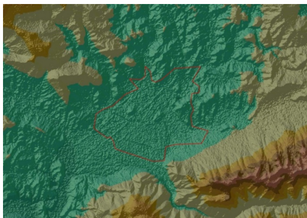
Fig. 3. Washing of the relief of the research area.

For example, economic geography reveals the features of the geographical location of the city – this specific resource, perhaps the most important for development. It obliges to consider the city together with the environment, acting as its partner and at the same time addition, as well as the sponsored territory that it is obliged to serve and take care of. Changes in the city cause a response in the environment. By managing the development of the city, you can also manage the development of adjacent territories. The city, as an object of research, is important for geography, which finds application in it for subsidiary sciences and can realize the potential of an integrator science. Being a set of enterprises and devices that have a strong impact on the environment, the city not only becomes an area with a tense environmental situation, but also a factor that changes the environmental situation within a vast space [8].